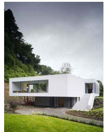
Private Dwelling, Maytree, Co . Wicklow