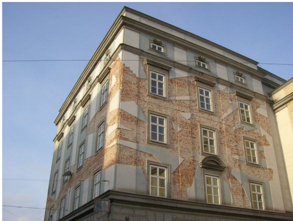
Der Bau. Amidst Us - Deconstruction of a building Gabu Heindl, GABU Heindl Architektur

The “ Europe 40 Under 40 ” program was initiated by The European Center as an annual program to spotlight and identify the next generation of architects and designers who will impact future living and working environments, cities, and rural areas.