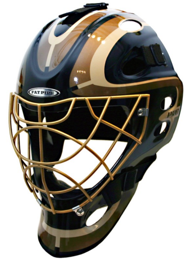
Fat Pipe Pro Helmet Nenonen Ville, 5D muotoilutoimisto Oy